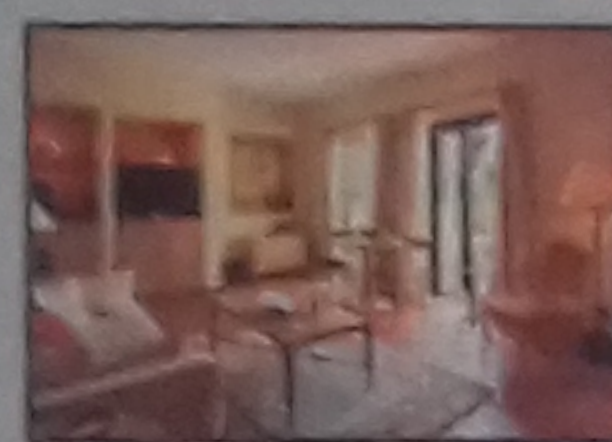
CLASSIC: Terre Blanche resort in Nice

I found a Nice and easy way to enjoy a mini break in the sun drenched south of France