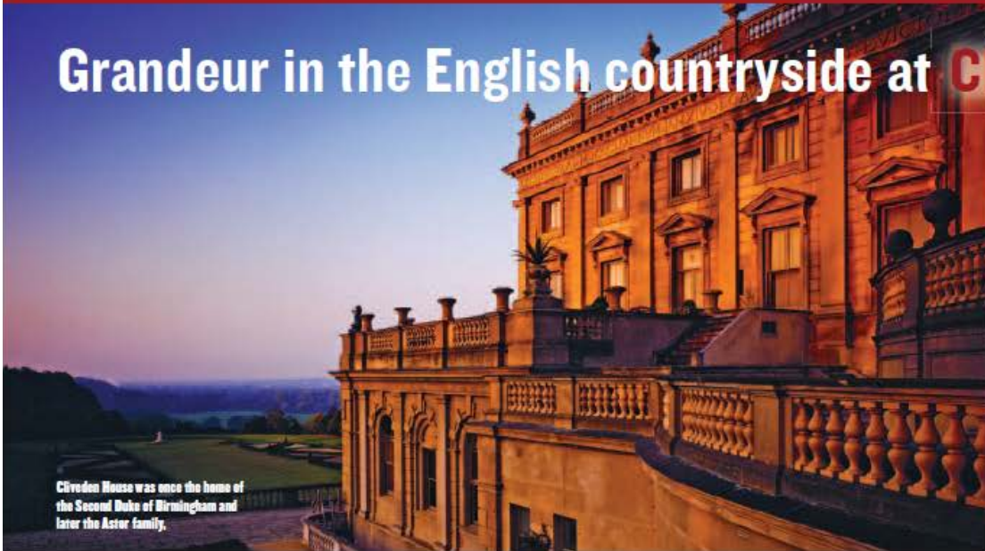
Cliveden House was once the home of the Second Duke of Buckingham and later the Astor family.