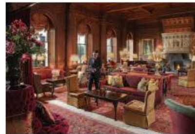
The great room at Cliveden House. The converted 19th century mansion is now a hotel with 47 rooms and suites.