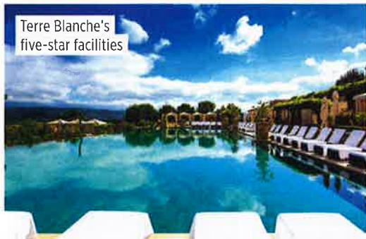
Terre Blanche's five-star facilities

and is a popular venue for the European Senior Tour's French Riviera Masters. Competitors will testify that this is a magnificent course, featuring a variety of perfectly manicured holes that thread through mature trees, flirting with a number of attractive water hazards on the way. Length is advantageous, but it's a course that requires great strategy and precise iron play.