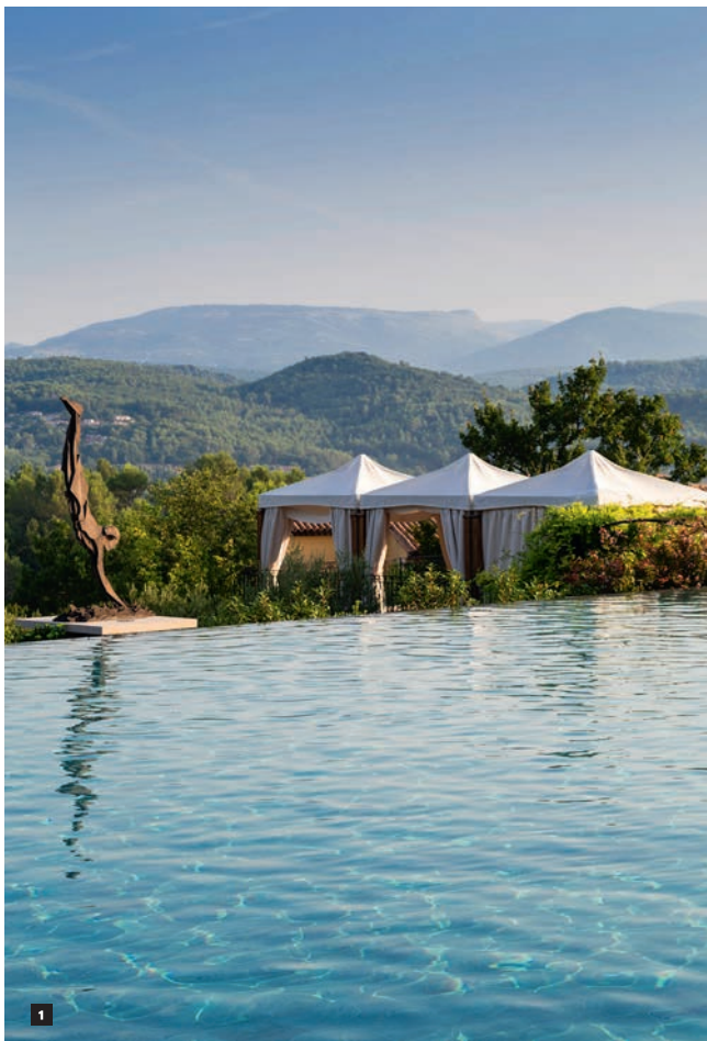
1 Подогреваемый бассейн в саду отеля – страховка от капризов погоды.