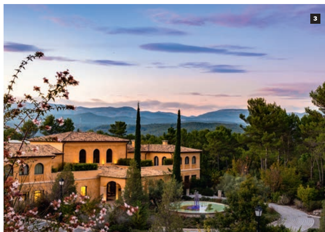
3 Отелю принадлежит более 300 гектаров прованских холмов, окружающих живописное здание на 115 номеров.