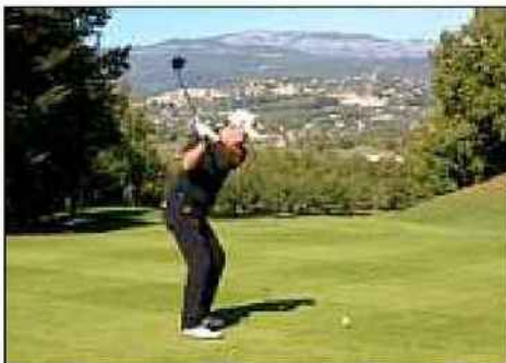
Pleins feux sur le parcours superbe de Terre Blanche qui va accueillir le grand prix de Ligue.