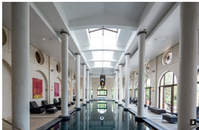
2 За коротким словом «спа» скрываются бассейн, 14 кабинетов для процедур, сауны, хаммам, фитнес-центр и чайная гостиная.