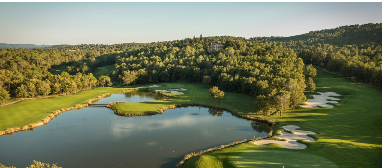
LE CHATEAU COURSE