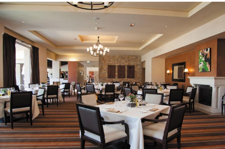
Les Caroubiers restaurant and lounge bar within The Clubhouse