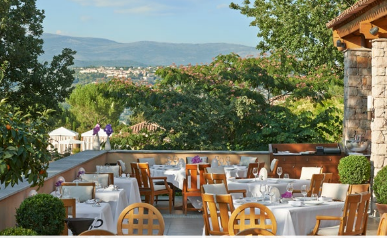
Le Faventia , contemporary French gastronomy restaurant