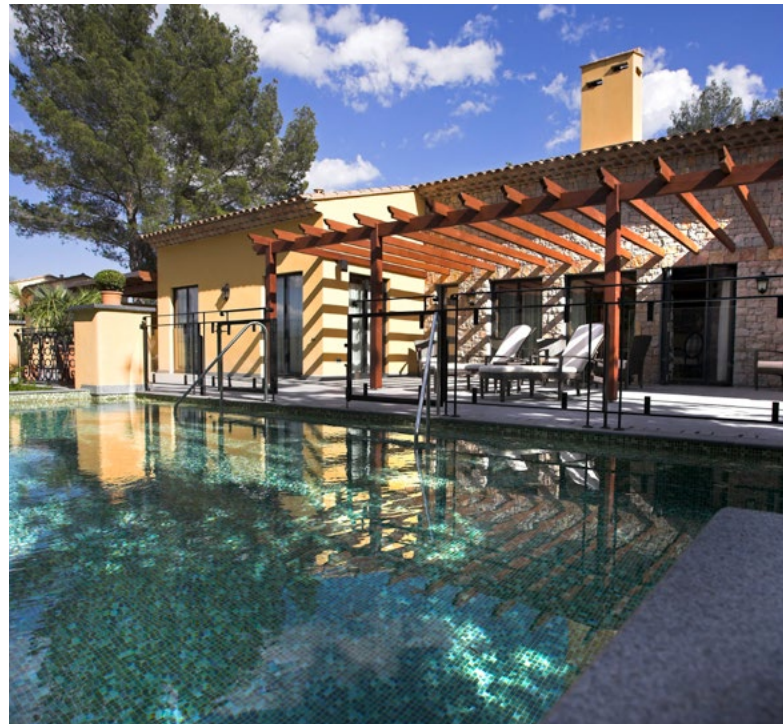
TERRE BLANCHE VILLA 300 square metres with both a private pool and jacuzzi