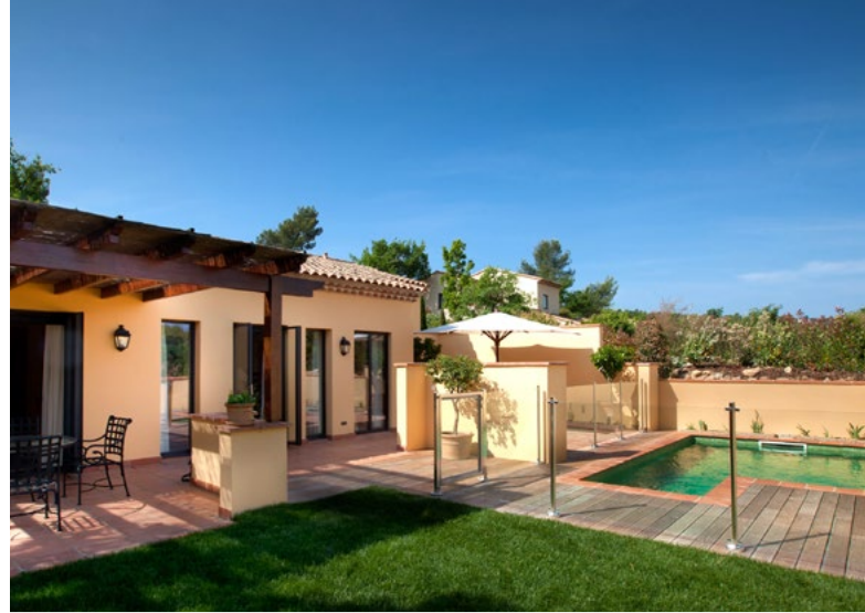
MÉDITERRANÉE VILLA 100 square metres with a private pool