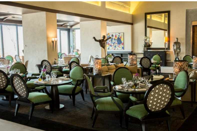
Le Gaudina restaurant and lounge bar