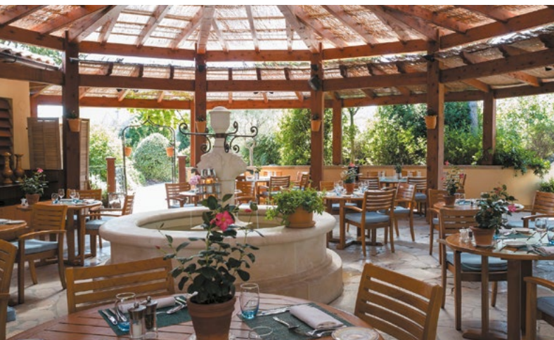
Le Tousco located adjacent to the infinity pool