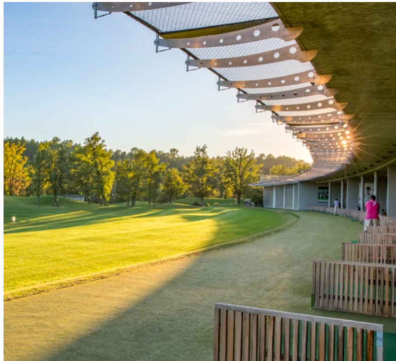
THE ALBATROS GOLF PERFORMANCE CENTER